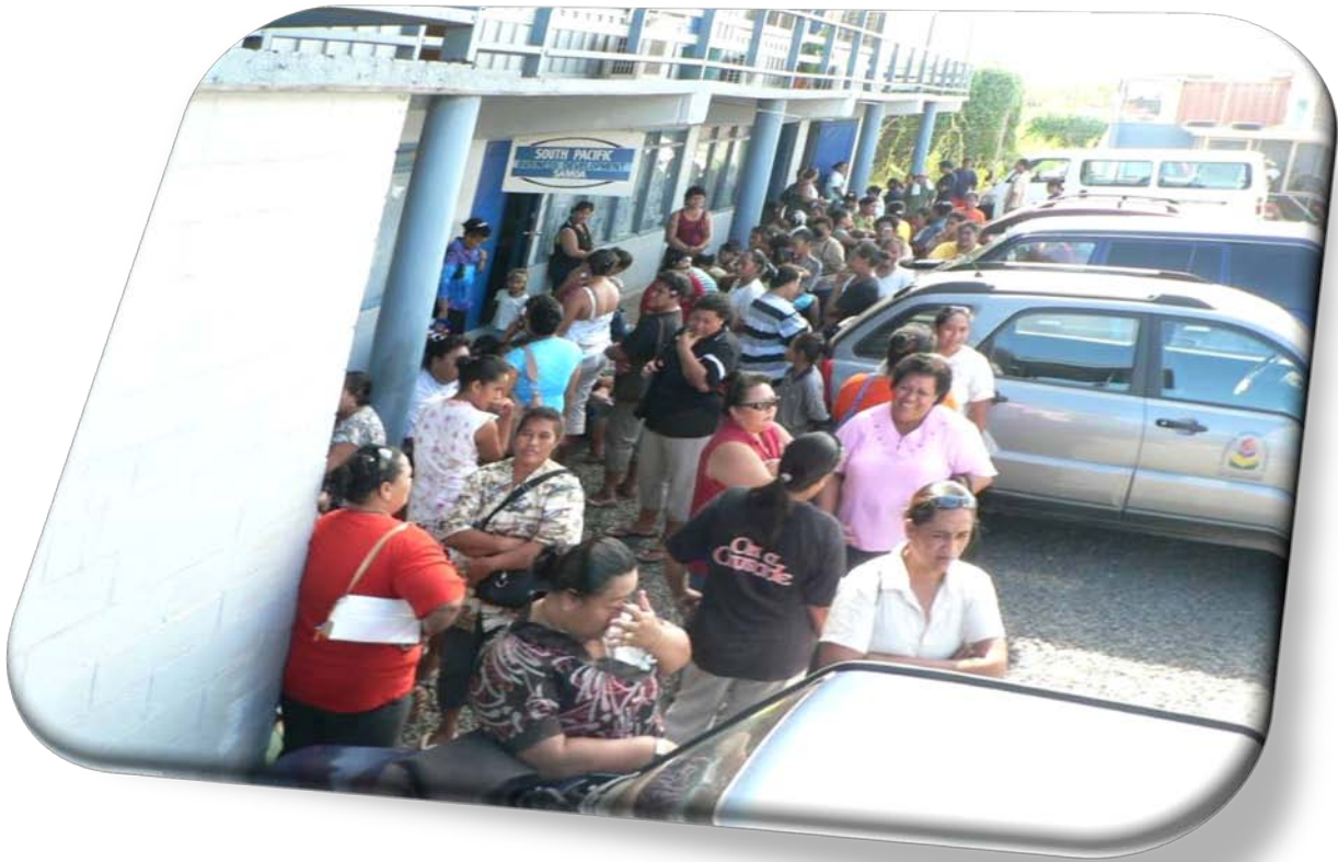
(Photo: SPBD members waiting outside SPBD office in, Samoa for Calamity Loan disbursement after Tsunami, Fall 2009)